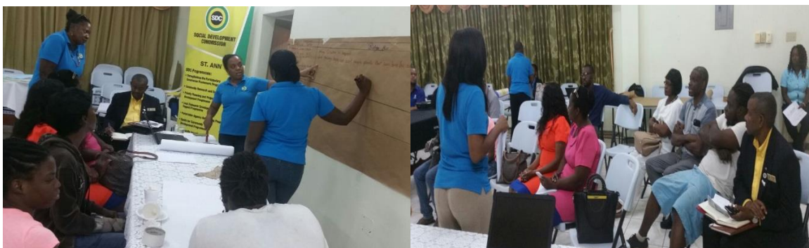
Members of the SDC Research department guides the analytical discussion with key stakeholders within the Ocho Rios community in developing a detailed Ocho Rios community profile.

The Wealth Ranking activity involved a more detailed look and explanation of critical findings of the survey carried out by the SDC research department, along with other key issue